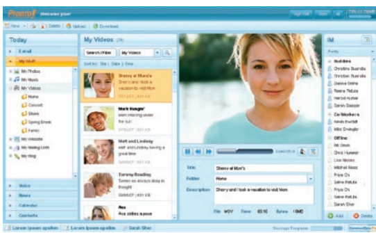
Pronto! is a dashboard for services including instant messaging

cations with no certainty that will succeed.